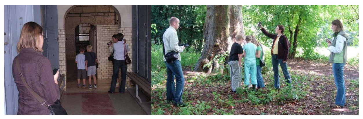
Figure 1. The "wizard" sends location information to the game PDA.