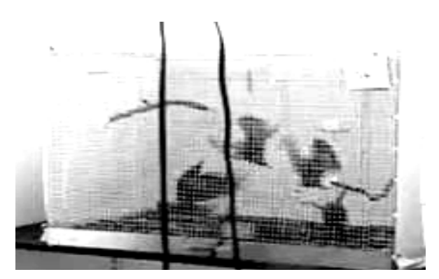
Figure 1. Composite photo showing a somersaulting starling.